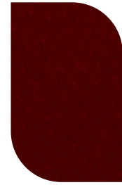
14 THEATRE RED