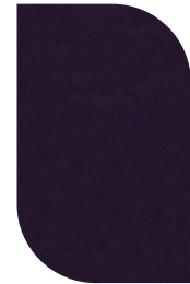
1008 DEEP PURPLE