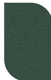
363-7273 ASPEN GREEN