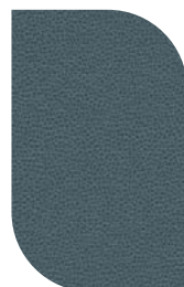
363-2604 STONE BLUE