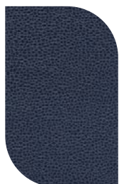
363-2672 CORN FLOUR