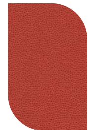
363-1396 BLOOD ORANGE