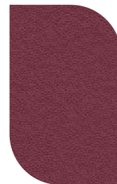
363-1398 CACTUS PEAR