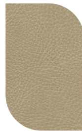
535-3340 DESERT TAN