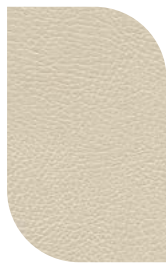
535-3480 NAVAJO IVORY