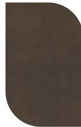
535-3231 FRENCH ROAST