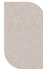
621-046 LIGHT GREY