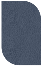
3003 PACIFIC BLUE