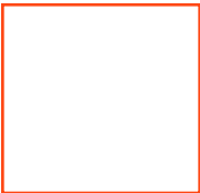
TABLE TOP: ..... Finish: .....