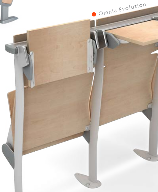
● Omnia Evolution