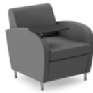
Amelia All Models