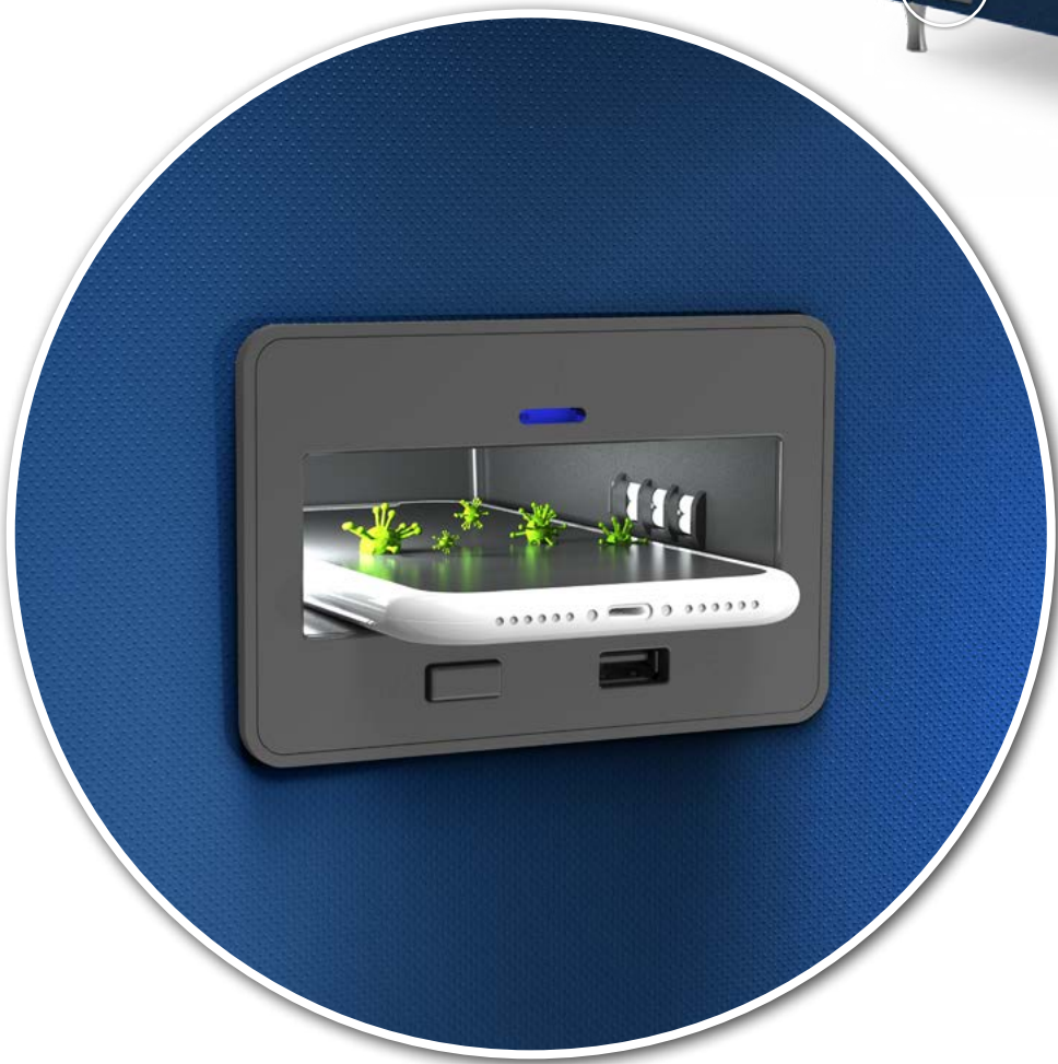
P u l i t o UV Cleaning and Charging Unit