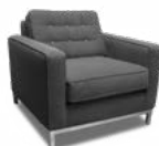
Townsend Elite All Models