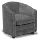
Milano All Models