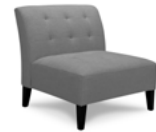
Keaton Select Models