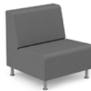
Erica Select Models