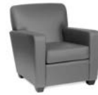
Ascot All Models