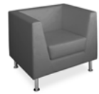
Naxos Select Models