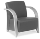
Cameron All Models