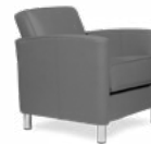
Saudi All Models