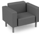
Block All Models