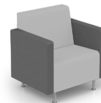
----L/----R Left Arm/Right Arm