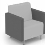
----L/----R Left Arm/Right Arm