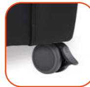
Dual Wheel Casters