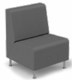
6321 Lounge Chair