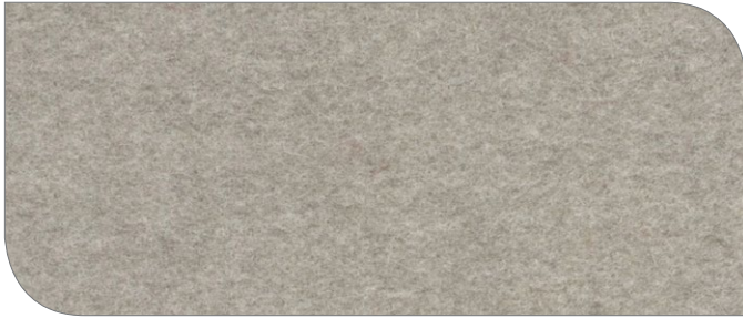
1105-1131 HEATHER MIST